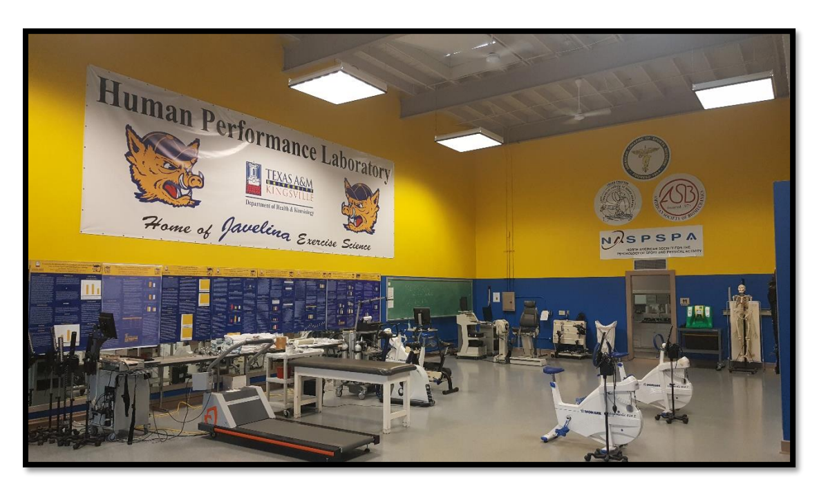
Equipment housed in the HPL includes:

For those students interested in the exercise sciences or the testing, measurement, and evaluation of fitness and/or human performance variables, the Department of Health & Kinesiology's Human Performance Laboratory (HPL) is located in the Health & Recreation Building. The HPL is comprised of the main lab (HREC 203) and seven sub-labs [Cardiovascular and Pulmonary Function (HREC208), Exercise Biochemistry (HREC 106a), Body Composition Assessment II (HREC 106b), Body Composition Assessment II (HREC 102), Heat Stress (103A), Motor Behavior (HREC 201-225), and HPL Annex (HREC 230)].