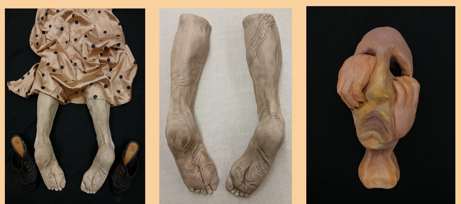
Artworks created by the Student Investigator with the assistance of the Principal Investigator.